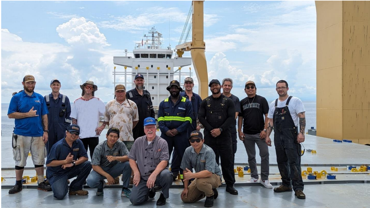
MM&P LDOs WORKING ABOARD THE MATSON VESSEL M/V KAMOKUIKI