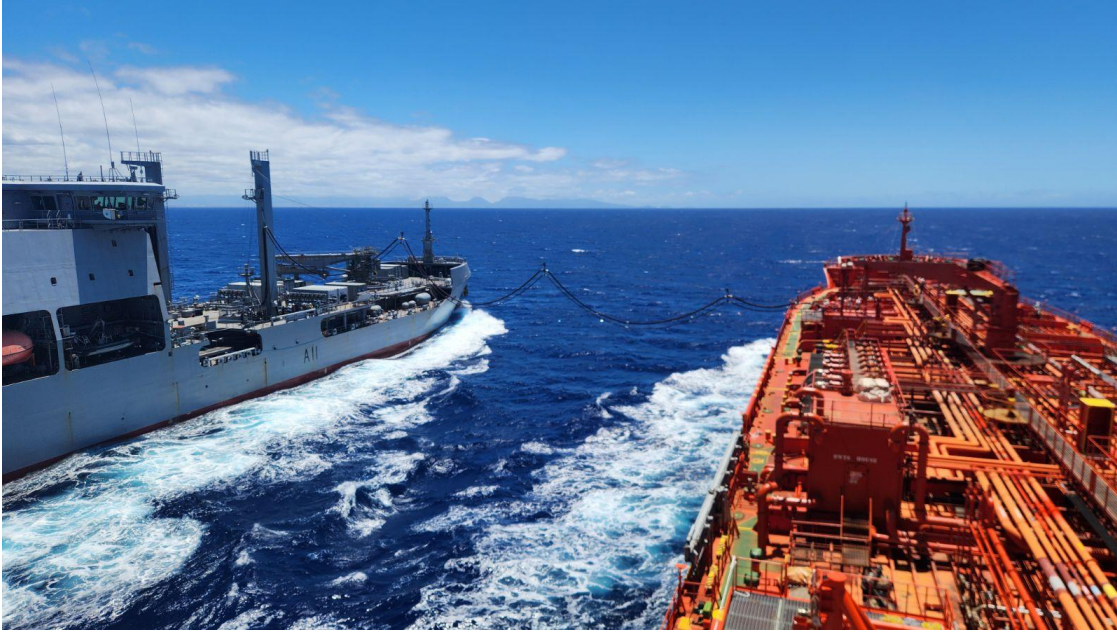
MM&P LDOs PERFORMING UNDERWAY REPLENISHMENT EXERCISES ON THE M/V ALLIED PACIFIC.