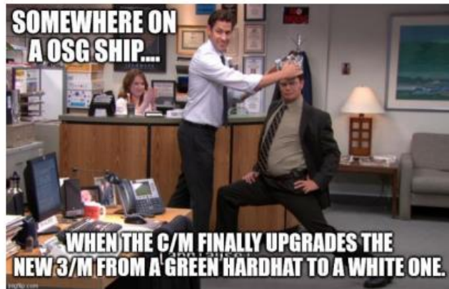
"BECOMING ONE OF THE TRIBE"