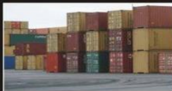
What importers/exporters think we do.