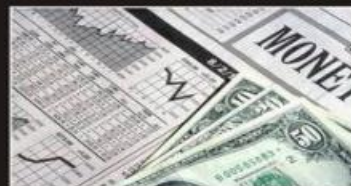
What government thinks we do.