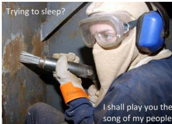
"MUSIC TO THE CHIEF MATE'S EARS."