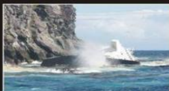
What mass media thinks we do.