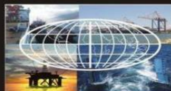
What we really do (connecting, feeding, providing energy, trade - moving the world!)