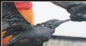
What environmentalists think we do.